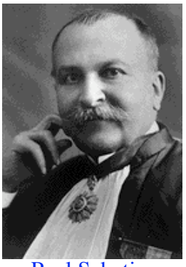
Paul Sabatier 1912 Co-Nobel Prize in Chemistry Hydrogenation by Metal Catalysis

\Delta H , which of the three isometric alkenes would dominate in an equilibrium mixture? How much heat is liberated in the isomerization of the monosubstituted alkene to the ( E )-isomer? Show work. Add the monosubstituted alkene to your diagram in 2c and illustrate the heat of isomerization.