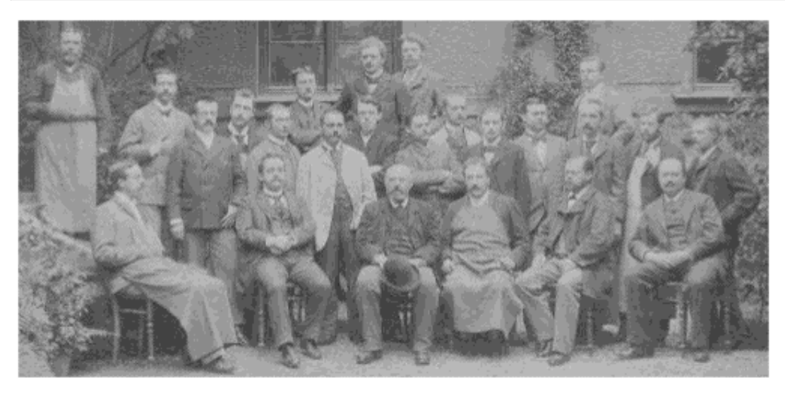
The Baeyer Laboratory, Munich, 1893

(This photograph is in the hallway across from 110 SCL)