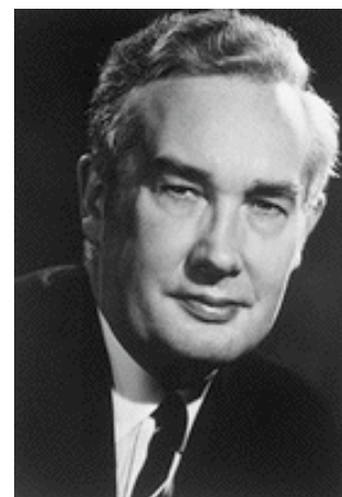
Sir Derek H. R. Barton (1918-1998)

1969 Nobel Prize with Odd Hassel for their work on conformational analysis