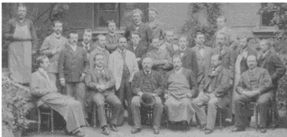
The Baeyer Laboratory, Munich, 1893

(This photograph is in the hallway across from 110 SCL)