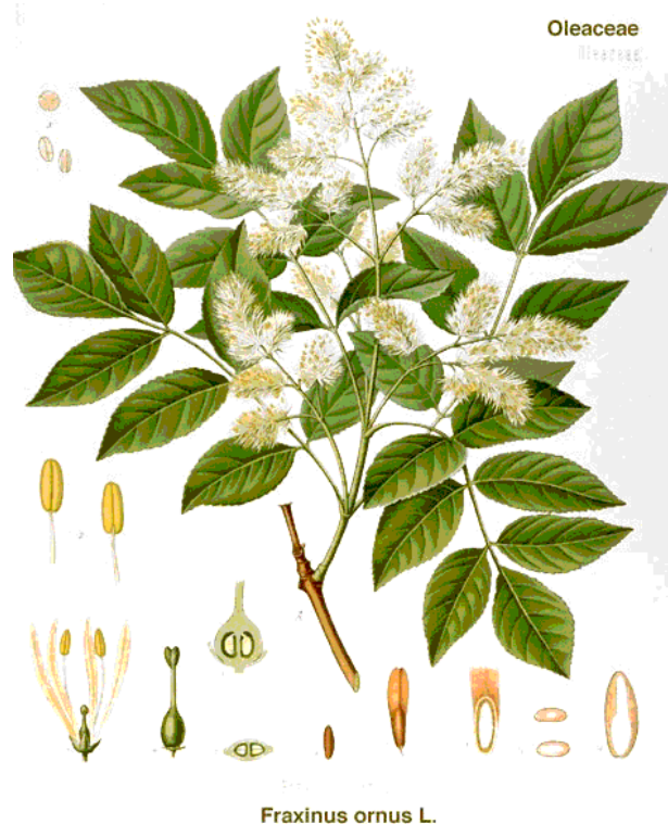
Fraxinus ornus L.

5. Aldose A undergoes Fischer-Kiliani synthesis to form two new aldoses, B and C . Both B and C